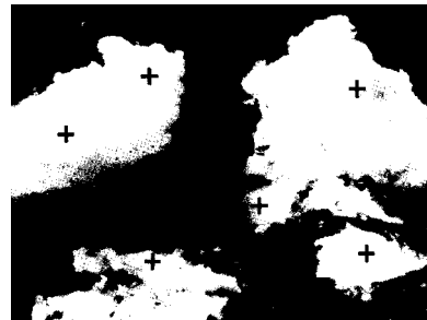
CLOUD MUSIC monitor with image of 6 crosshairs amidst lively cloudscape.

Like sailing, the music is weather-dependent."