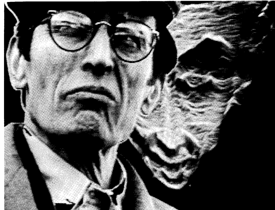
Art of Memory

This program of early works includes didactic explanations of Vasulka's image-making tools, and also charts his development of a grammar of these imaging techniques. Vocabulary is "designed to convey in a didactic form the basic energy laws in electronic imaging." Here a hand, as a metaphor for expression and gesture, and a sphere that symbolizes form, are processed with a keyer, colorizer and scan processor. The Matter , C-Trend , and Explanation are methodical, didactic works that deconstruct the essential elements of electronic imaging and then attempt to construct a syntax from those elements. In The Matter , a generated dot pattern is re-sculpted into myriad three-dimensional forms and shapes by waveforms, which also generate sound. In C-Trend , a view of traffic shot from a window is transformed and sculpted into permutations of abstract, three-dimensional forms. Explanation is a computer-generated cross-hatch of lines that becomes three-dimensional, defining shapes in a synthetic landscape of gradually shifting image position and size.