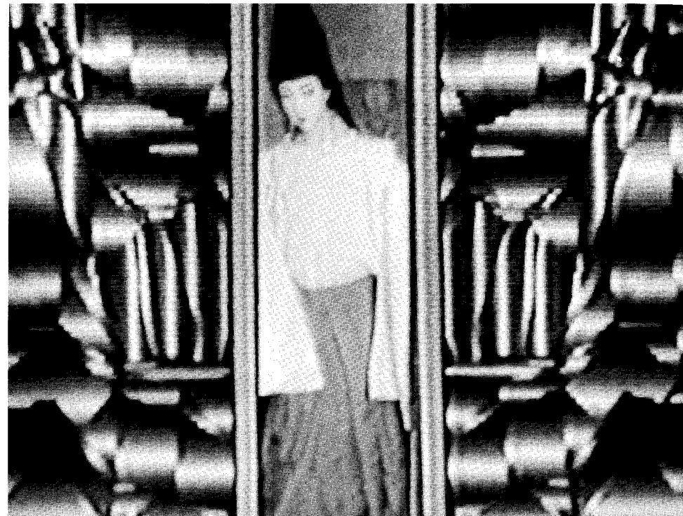
In the Land of the Elevator Girls

This program presents the Vasulkas' early formal experimentations with analog image processing and their investigations of multiple camera set-ups and keyers to articulate spatial, temporal and sound/image manipulation. Solo For 3 is a didactic yet playful exercise in which three cameras were trained on three different images of the number three. Image planes are layered, arranged and sequenced; the result is a multifaceted choreography of numbers. Reminiscence is an otherworldly record of a Portapak walk through a farmhouse in Moravia, the site of Woody Vasulka's youth, as seen through the transformative effects of the Rutt/Etra Scan Processor. Images become eerily sculptural, fading in and out of abstraction, as if in evocation of memory. Soundgated Images is an early example of the Vasulkas' ongoing explorations of interfacing modes of simultaneously generated sound and image, in which abstract, processed images are transposed as electronic sounds. Noisefields is an important example of these early experiments, a visualization of the materiality of the electronic signal and its energy. Colorized video noise (or snow) is keyed through a circle, producing a rich static sound that is modulated by the energy content of the video.