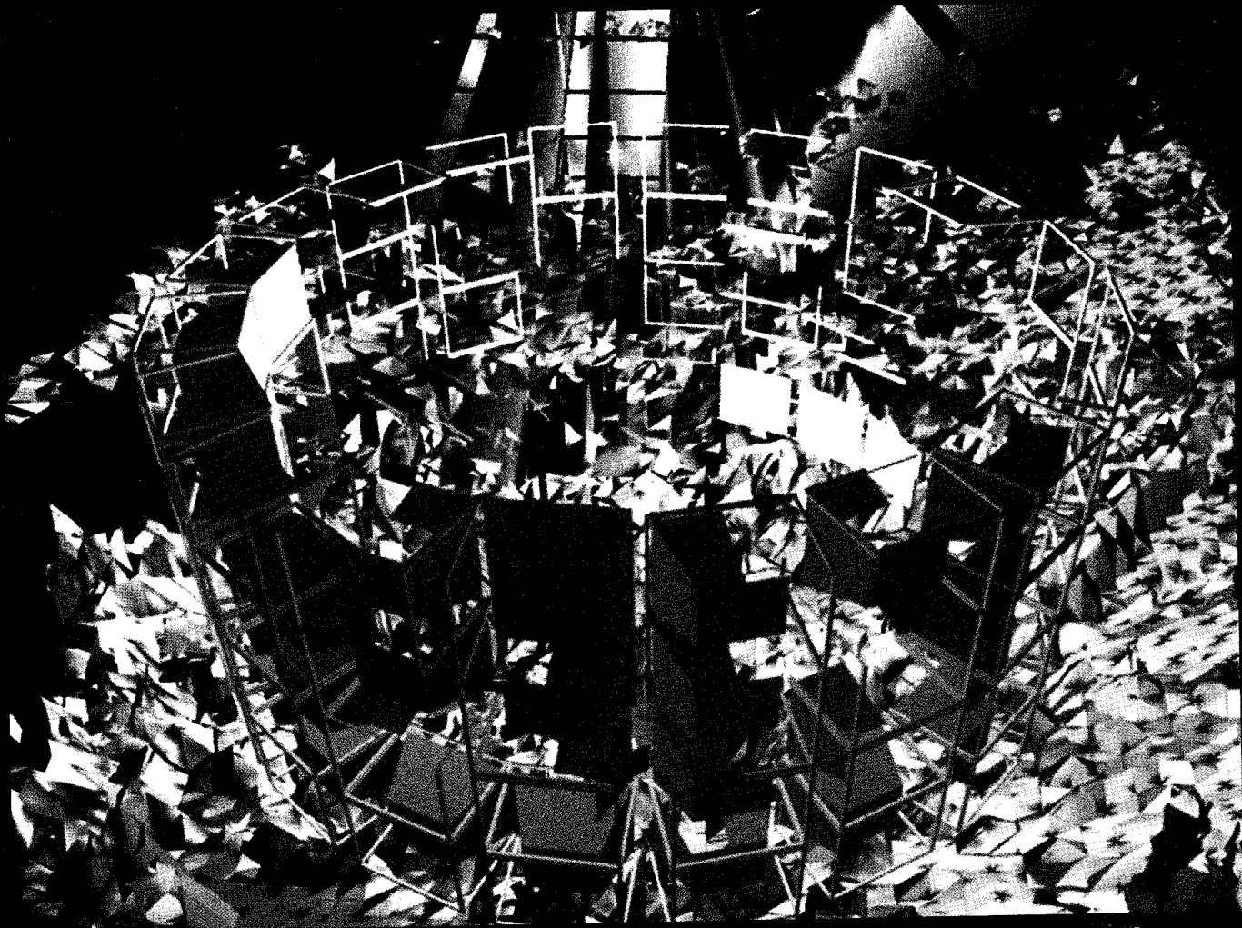
Woody Vasulka, "The Brotherhood," 1994-96.

Interactive computer-driven opto/electro/mechanical constructions; "Table 1," 1996, illuminated plotting table, computer, video camera, stepper motors, dynamic projection/screen positioner, environment sensors. Courtesy of the artist.