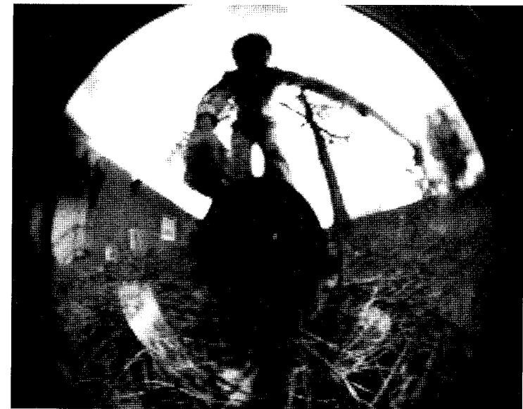
Steina, "Summer Salt," 1982.

Eighteen minutes, color, sound. San Francisco Museum of Modern Art.