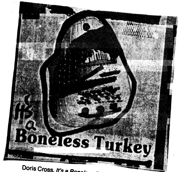
Doris Cross, It's a Boneless Turkey , Adaptation