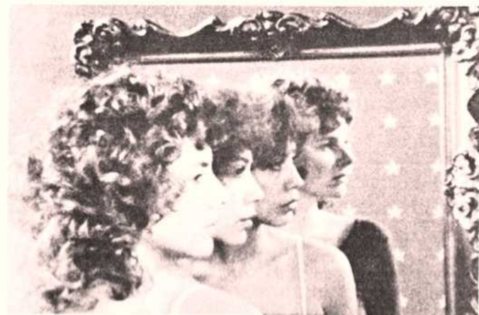
THE SCENIC ROUTE