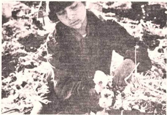
GARLIC IS AS GOOD AS TEN MOTHERS

"You can't get lonesome when you eat."—Mance Lipscomb