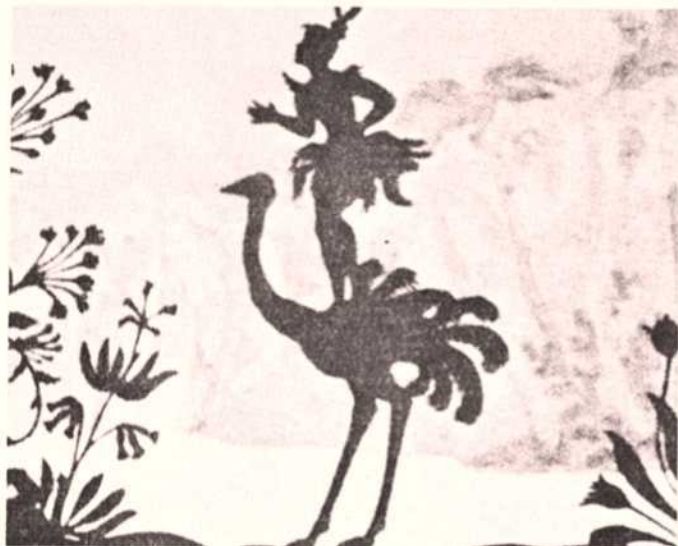
THE ADVENTURES OF PRINCE ACHMED

Lotte Reiniger, collaborating with Carl Koch, created a unique and inimitable style of animated cinema, based on silhouettes of articulated figures cut out of cardboard, tin and paper. Achmed is her greatest achievement, exquisitely illustrated and filled with experimental techniques. The story of Prince Achmed is a marvelously imaginative fairy tale, and follows its dream logic inexorably through the graphic metamorphoses of Reiniger's silhouette style.