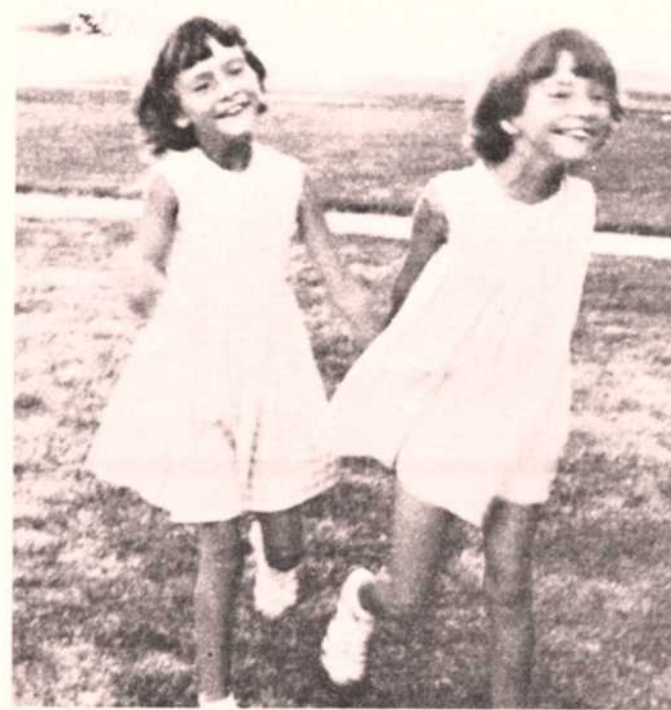
POTO AND CABENGO

The only sound film by the genius of the German theater, Max Reinhardt, was made in collaboration with his disciple William Dieterle, a former actor. Though it captures much of the spirit of Shakespeare's play, the text is heavily edited to allow full rein to Reinhardt's famous production effects. In one sequence, for example, the fairy king's cape grows from conventional size to the length of a football field, using only the simplest of film techniques—editing—to create an astonishing and dreamlike effect. The Warner Studios expended great effort on this million dollar spectacular, and many major stars such as James Cagney, Joe E. Brown, Olivia de Havilland, and Dick Powell appear in startling but oddly successful roles.