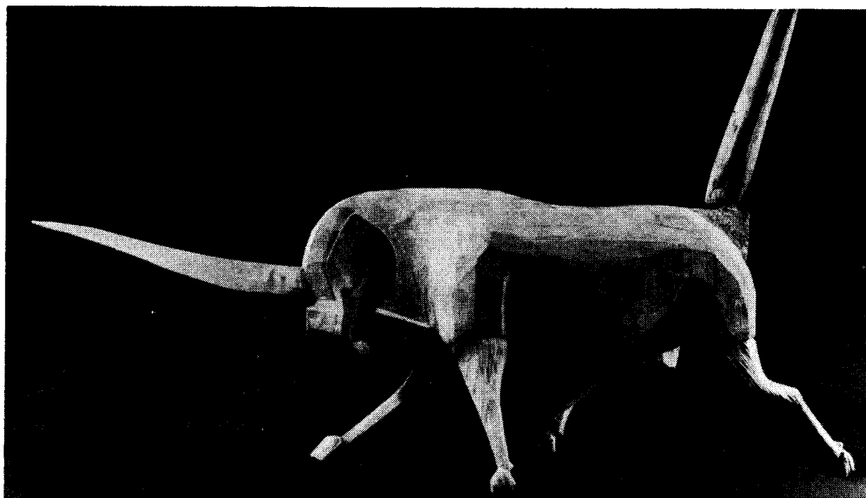
PAINTED WOODEN UNICORN, Western Han Dynasty, 2nd century AD, unearthed 1959, Wuwei, Kansu.