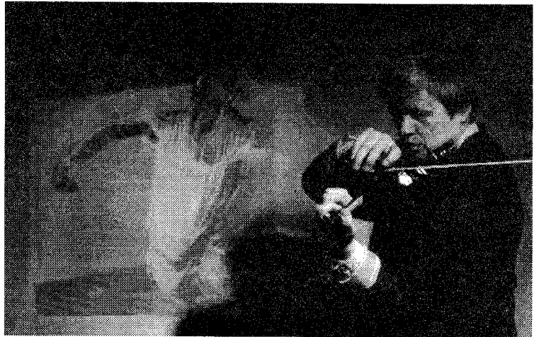
Steina, performing "Violin Power"

Wednesday, May 5 7:00 pm Ridges Auditorium