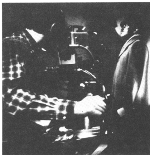
Production still from Terrance J. Lappin's Re Vera featured in Works in Progress .

Residences for next fall are still under discussion. Schools outside of the Metropolitan area are especially encouraged to apply. Interested parties should contact UCVideo for application details.