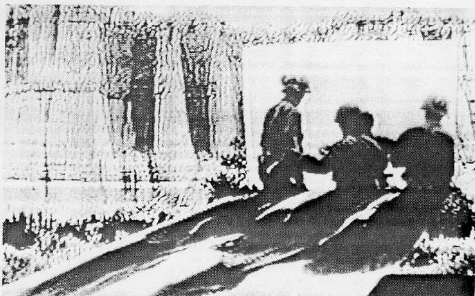
Woody Vasulka - The Art of Memory

Stelna Lilith 1987 6:00 (excerpt) Santa Fe, USA