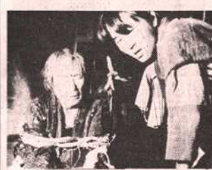
THE BALLAD OF NARAYAMA Nov 17/18

Grand Prix at Cannes Nov 17/18 THE BALLAD OF NARAYAMA Saturday & Sunday, Muenzinger Aud. 7 & 9:15 pm. Admission $2.50. Directed by Shohei Imamura.