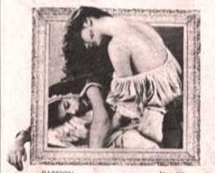
PASSION Nov 3/4

Godard's Film-Within-a-Film Nov 3/4 PASSION Saturday & Sunday, Muenzinger Aud. 7 & 9 pm. Admission $2.50. Directed by Jean-Luc Godard.