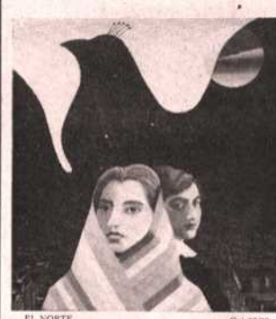
EL NORTE Oct 27/28