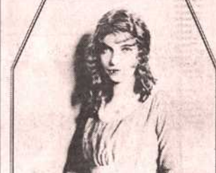
REUBEN, REUBEN Dec 8/9

Oscar Nominee Tom Conti Dec 8/9 REUBEN, REUBEN Saturday & Sunday, Muenzinger Aud. 7 & 9 pm. Admission $2.00. Directed by Robert Ellis Miller.