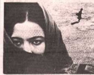
BABY, IT'S YOU Nov 10/11

1960's Coming-of-Age Nov 10/11 BABY, IT'S YOU Saturday & Sunday, Muenzinger Aud. 7 & 9 pm. Admission $2.00. Directed by Stanley Kubrick.