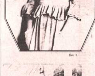
AND THE SHIP SAILS ON Dec 15/16

Federico Fellini's Latest Dec 15/16 AND THE SHIP SAILS ON Saturday & Sunday, Muenzinger Aud. 7 & 9:15 pm. Admission $2.50. Directed by Federico Fellini.