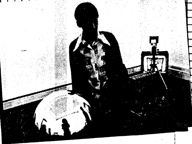
Steina's experimental video will be part of the Video As Attitude exhibition opening May 13.