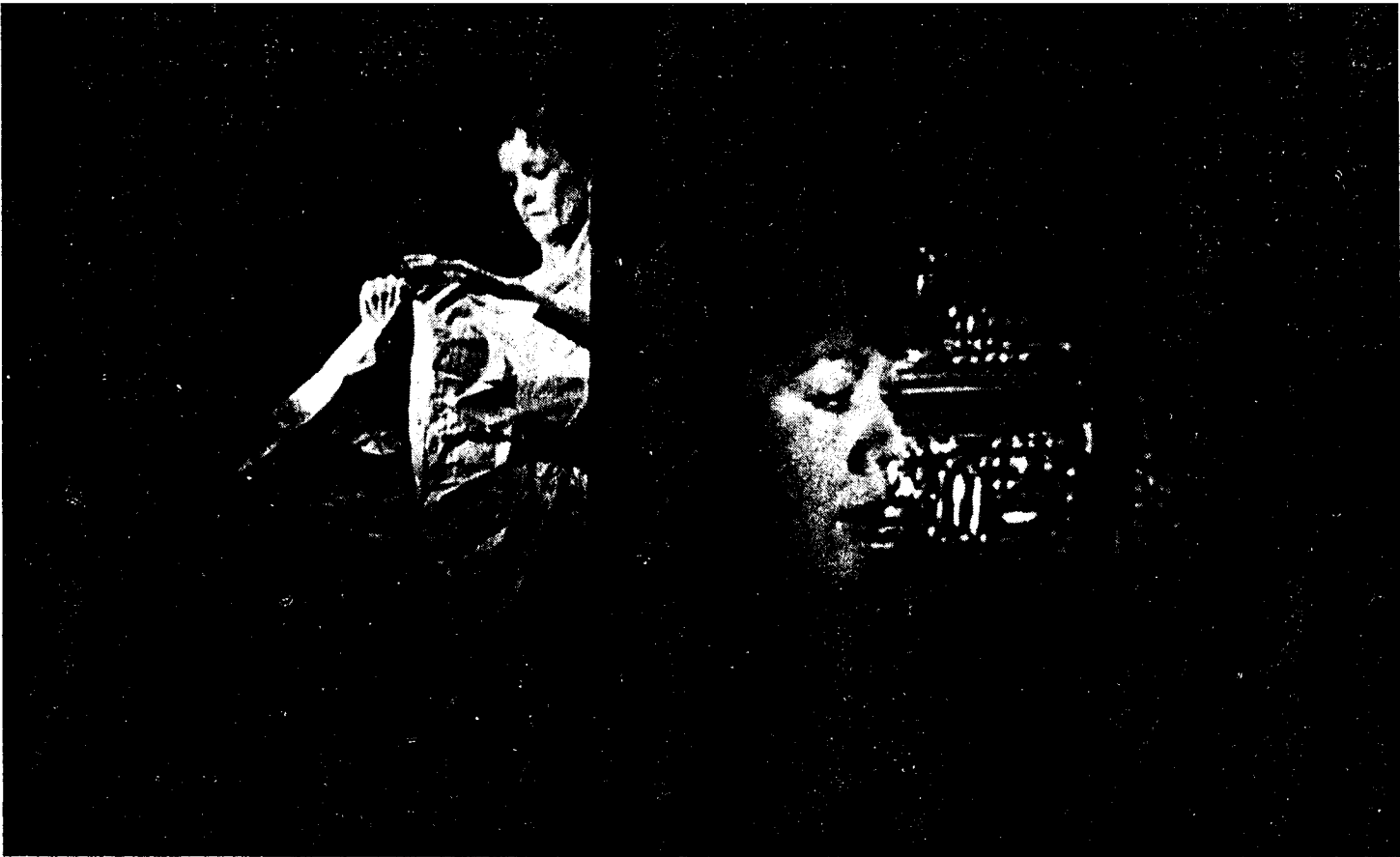
Joan Jonas in 'He Saw Her Burning': What happened to the happening in the '80s?

Viewers will probably have to work a bit to absorb the ramifications of this exhibit. The video/sculpture medium is not brand new, but it is still young. Unlike cast-bronze sculpture or film, it does not lend itself to being collected or to being sold as entertainment. What it does do is provide mirrors for the present moment, which is as good a definition as any for what art has always done.